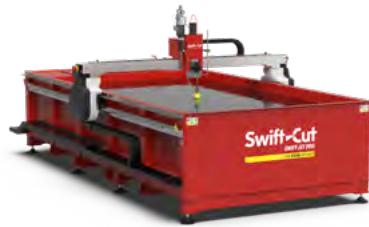
Swift-Jet Pro 510 5' x 10' cutting area