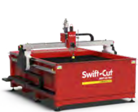
Swift-Jet Pro 55 5' x 5' cutting area

Our most competitive waterjet table yet. Fantastic price point/value for money. Cut almost anything. Cold process (no heat affected zone). Precise. Repeatable. Versatile. Economical (compared to other waterjet solutions).